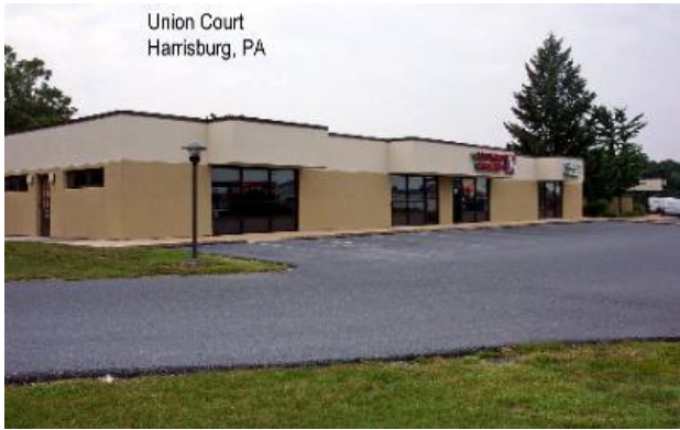
Union Court Harrisburg, PA